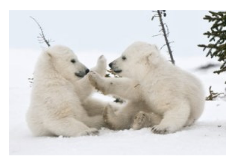
If you have friends who make you laugh, spend lots of time with them!

In extreme cases, a doctor may recommend surgery to fashion a new stoma through the skin